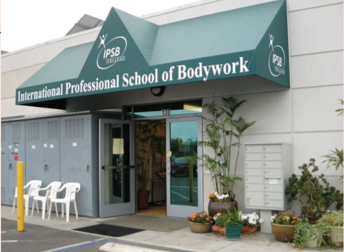
The International Professional School of Bodywork (IPSB) in San Diego, California.

Thank you, IPSB, for sharing your ideas with the massage and bodywork school community. If you would like to share a great idea from your school, download the form at www.abmp.com and email it to edu@abmp.com. Your responses may be shared online or in print, and may be edited for length. You can also contact your school liaison for more information or for support in accessing our Student Success program. ©